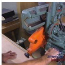
Jobs for Veterans' State Grants