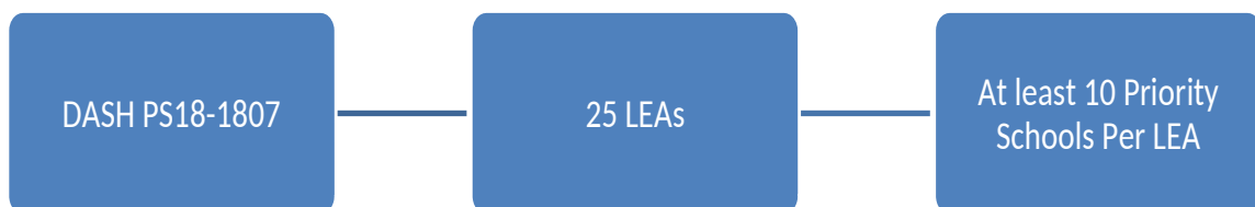
Figure A.1-1. Linkages

The data will be collected from funded LEAs via the Program Evaluation and Reporting System (PERS). DASH and its contractor, ICF, will use PERS to organize, plan, and track the