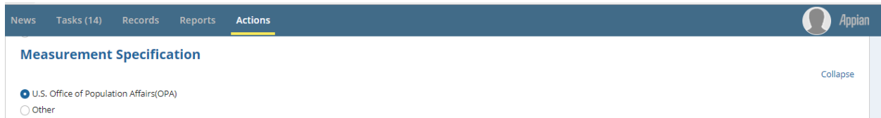
Figure 1: Measurement Specifications – Path 1