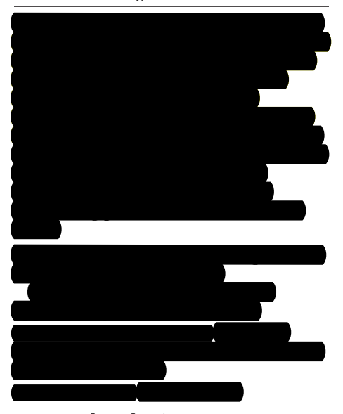
Paperwork Reduction Act