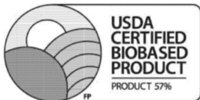
Figure 1. USDA Certified Biobased Product Certification Mark (Note: actual size will vary depending on application)

Certification mark artwork. The distinctive image, as shown in Figures 1-3, that identifies products as USDA Certified.