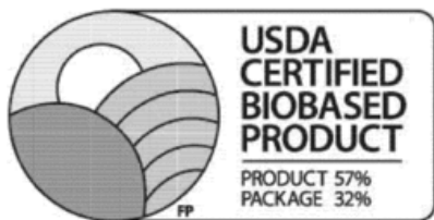
Figure 3. USDA Certified Biobased Product & Package Certification Mark (Note: actual size will vary depending on application)