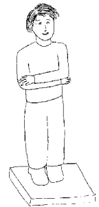
Figure 1: Stance for modified Romberg test