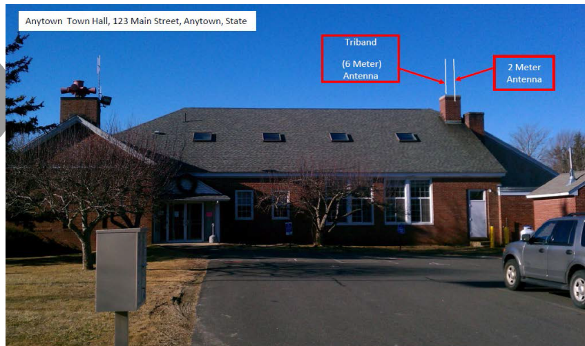
Figure 2. Example of ground-level photograph showing proposed attachment of new equipment.

Ground-level photographs. The ground-level photograph in Figure 2 supplements the aerial photograph in Figure 1, above. Combined, they provide a clear understanding of the scope of the project. This photograph has the name and address of the project site, and uses graphics to illustrate where equipment will be installed.