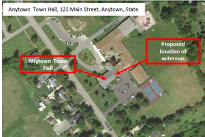
Figure 1. Example of labeled, color aerial photograph.

Aerial Photographs. The example in Figure 1 provides the name of the site, physical address and proposed location for installing new equipment. This example of a labeled aerial photograph provides good context of the surrounding area.