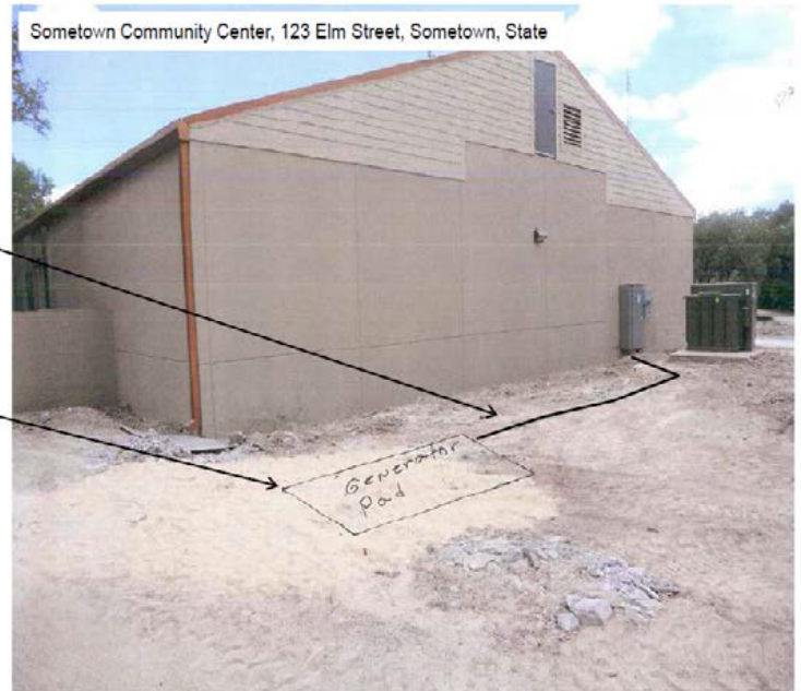
Figure 4. Ground-level photograph showing proposed ground disturbance area.