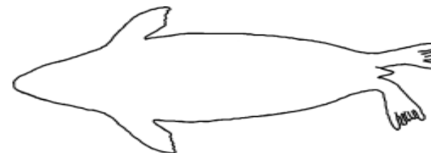
Circle one: Dorsal / Ventral