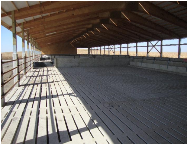
Confinement barn with slatted floor