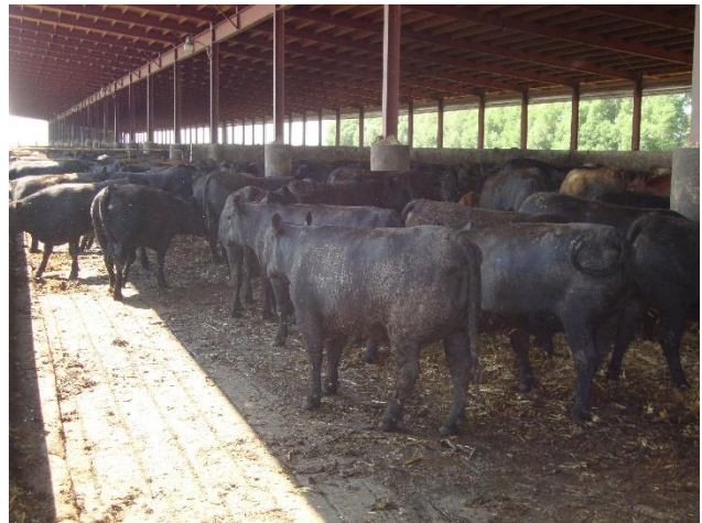
Confinement barn with bedded pack