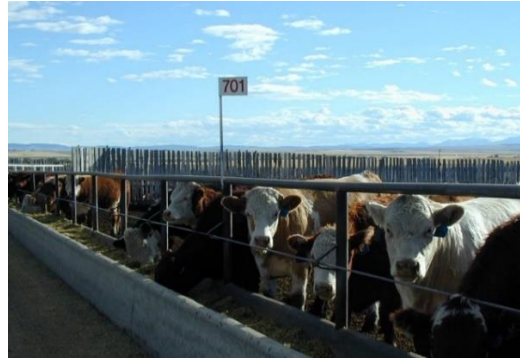
Wind fence