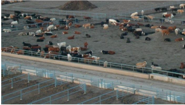
Open dry lot