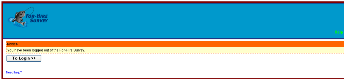
Figure 20 – logged out screen

The Notice screen displays an informative note as to whether the vessel representative logged off or the For-Hire Survey Web site automatically logged off the vessel representative from the Web site (see Figure 20).