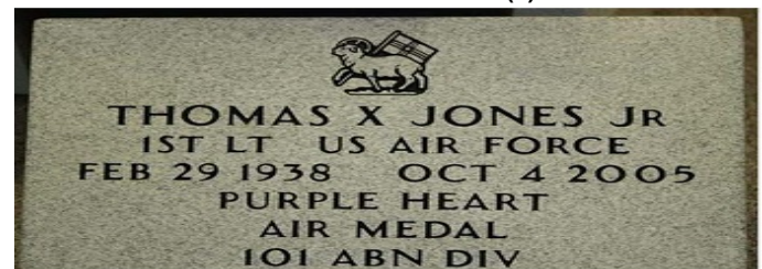
SMALL FLAT GRANITE (L)

This grave marker is 18 inches long, 12 inches wide, and 3 inches thick. Weight is approximately 70 pounds. Variations may occur in stone color.