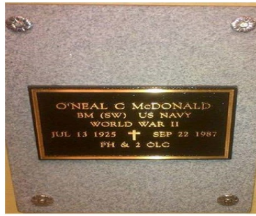
BRONZE NICHE (Z)

This niche marker is 8-1/2 inches long, 5-1/2 inches wide, with 7/16 inch rise. Weight is approximately 3 pounds; mounting bolts and washers are furnished with the marker. Used for columbarium or mausoleum interment. Also provided to supplement a privately-purchased headstone or marker for eligible Veterans who died on or after November 1, 1990 and are buried in a private cemetery.