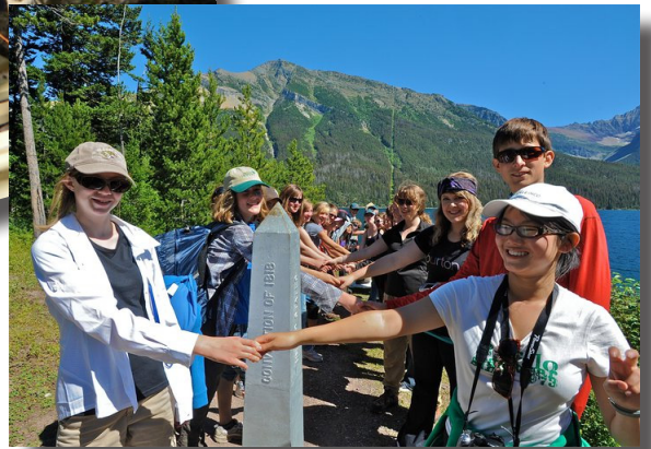
Canada Forest kids