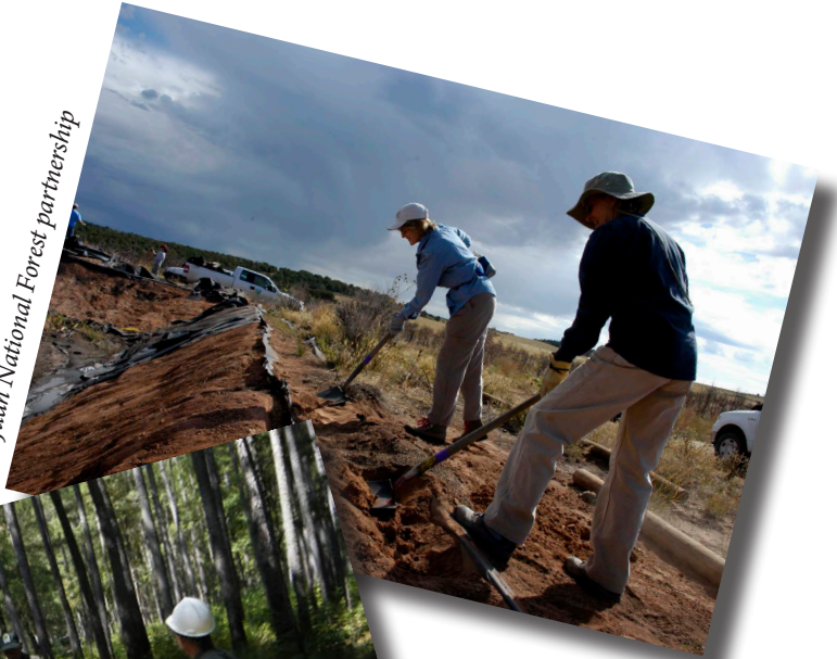
San Juan National Forest partnership