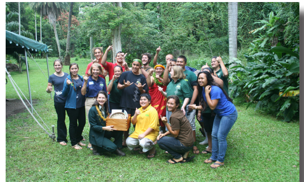
Hawaii Year of the Forest

Youth Engagement and Employment Initiative. Empowering youth for active citizenship and preparing them for effective stewardship of our Nation's resources are among America's highest priorities for the 21st century. This new initiative, developed in collaboration with NFWF and the BLM, will support both youth conservation employment opportunities and conservation education and outreach outcomes. The Forest Service is working with a broad array of Federal agencies, non-governmental organizations, educational institutions, and others to support partnerships that build an understanding of conservation and develop service opportunities, quality jobs, and career pathways for America's youth—especially those who are often underserved. Through this initiative, diverse youth will be engaged in meaningful conservation work and programs that not only make a difference on the ground, but also develop work skills and experience for future careers in natural resources. The Forest Service has committed more than $700,000 to these initiatives, and dedicated partner funds total $1.4 million.