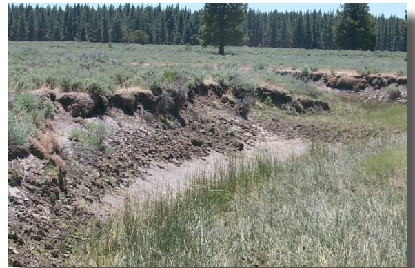
Folchi Creek Watershed in CA

California Ecological Restoration with Power and Water Utilities Initiative. Half of all surface water in California originates on national forest watersheds, with downstream consumers realizing an estimated value of nearly $10 billion every year. But there are significant threats to these valuable watersheds. This partnership brings beneficiaries of the watersheds together to overcome resource challenges, forming relationships with major utilities and encouraging restoration work in key ecosystems.