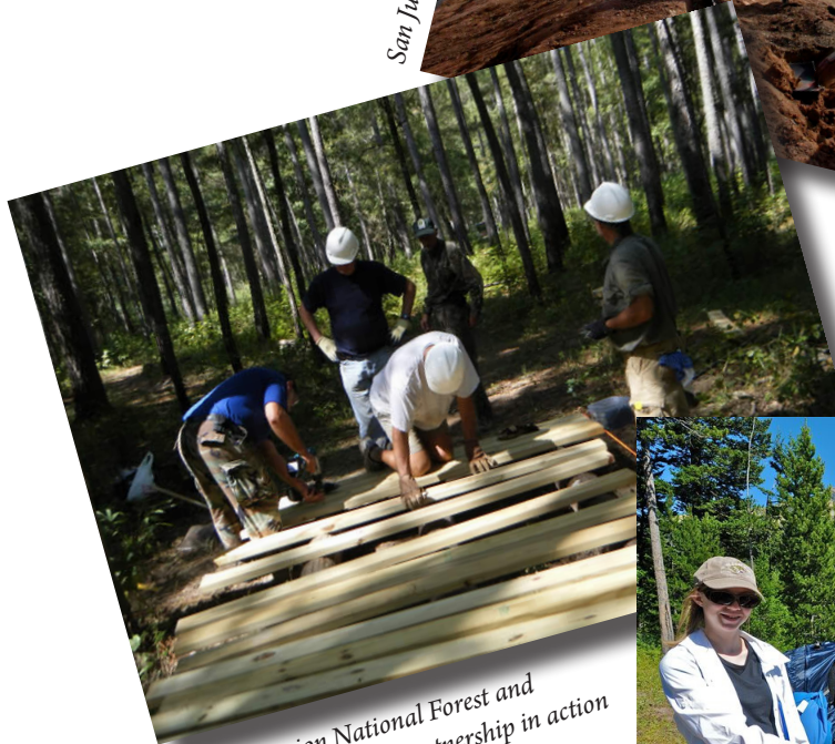
Francis Marion National Forest and Palmetto Foundation partnership in action