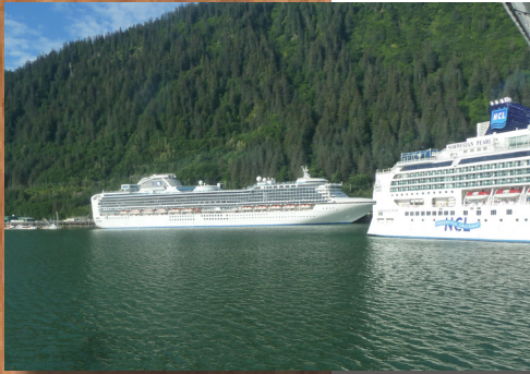
Juneau cruise ships

Recreation Restoration, Adaptation, and Ski Area Campaign. Since 2006, NFF has collaborated with 16 ski areas through the Ski Conservation Fund. Dedicated to conservation and recreation improvement projects on public lands, contributions totaling more than $3 million have been raised via donations from lodging guests, skiers, snowboarders, ski school participants, and golfers. Work continues to expand the Ski Conservation Fund and its contribution mechanisms to both additional ski areas and other partners, such as outdoor retailers and reservation systems, to ensure that the landscapes that visitors enjoy are restored and maintained.