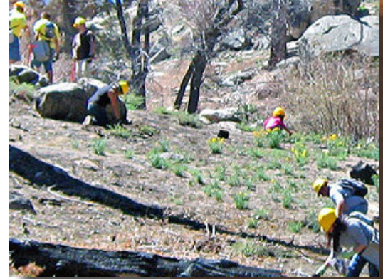
Station Fire restoration

Sequestering Carbon by Reforesting National Forests. This partnership 4 enables organizations to reduce their greenhouse gas emissions through the voluntary marketplace and reforestation efforts. The result will be restored wildlife habitat, improved water quality, and climate change mitigation. Since 2008, NFF has facilitated eight carbon sequestration projects that cover more than 5,000 acres of national forest lands, involve planting 1.3 million seedlings, and are anticipated to offset 700,000 metric tons of carbon. Nearly $5 million in partner contributions have already been raised to fund this initiative by corporate partners, including Disney, the Southcoast Air Quality Management District in California, El Paso Corporation, and Chevrolet.