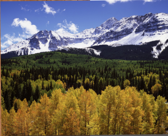
San Juan Mountains, CO

The U.S. Forest Service, the largest agency within the U.S. Department of Agriculture, has a long and distinguished history of public service and land stewardship. Gifford Pinchot, the first Chief of the Forest Service, said that the agency should always work to provide the greatest good for the greatest number of people in the long run.