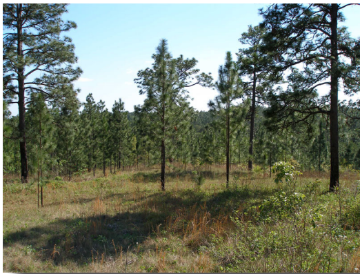
Longleaf pine restoration

America's Longleaf Restoration Initiative. The longleaf pine ecosystem once covered approximately 90 million acres in the Southern United States. But by the early 1990s, 97% of this ecosystem had been lost, stressing the nearly 30 threatened and endangered species that live there. Since then, the Forest Service and the National Fish and Wildlife Foundation (NFWF) have worked with numerous partners to successfully restore longleaf pine forests throughout the Southeast. The America's Longleaf Restoration Initiative, which engages Federal