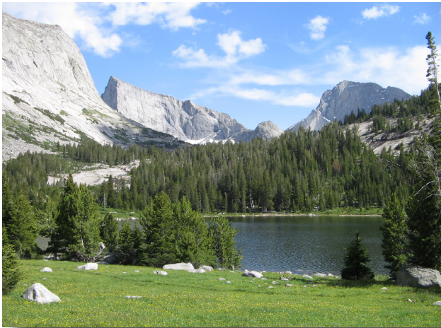
Bridger Wilderness in Wyoming