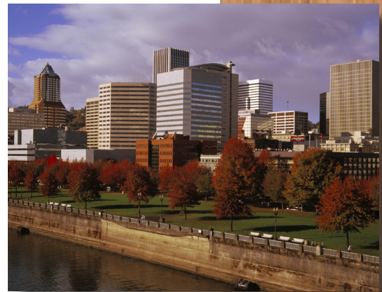
Portland, OR, waterfront

Urban Waters Federal Partnership. Many of our Nation's urban rivers, streams, lakes, forests, and wetlands are polluted, degraded or inaccessible. Research demonstrates that a clean, safe, accessible, urban environment—including urban forests, gardens, parks, lakes, aquifers, and rivers—is directly linked to improved public health, stronger local economies, and lower crime rates. Through the Urban Waters Federal Partnership, the Forest Service and 11 other Federal agencies are revitalizing urban waters, supporting local partnerships, restoring forest resources, fostering community engagement in urban watersheds, and transforming overlooked assets into drivers of urban revival at seven pilot locations across the country. Nearly $1 million has been committed to accomplishing these goals.