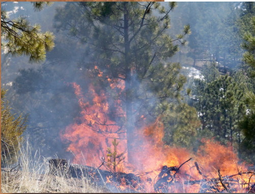
Active fuel treatment in the municipal watershed

Governor Kitzhaber and created in the late 1990s to ensure the availability of financial resources for habitat and watershed restoration. The Oregon Lottery provides the Board with the majority of its grant dollars.