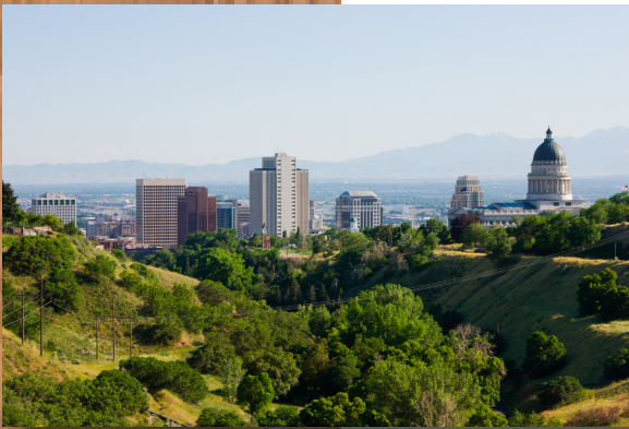
Salt Lake City, UT

Rocky Mountain Watershed Protection Partnership. Four major river systems and the water supply of over 4 million people on the Front Range of Colorado and southern Wyoming are under duress from climate change and a history of aggressive fire suppression. This partnership, with coordination and support from the National Forest Foundation (NFF), invests public and private funds in the watershed restoration projects necessary to protect these resources. Partner funding and support for this partnership is broad and comes from many sources, such as Denver Water, Aurora Water, Colorado Springs Utilities, Vail Resorts, MillerCoors, Coca-Cola, the Gates Family Foundation, and the Coalition for the Upper South Platte. One example that highlights this support is Denver Water: the utility is matching $16.5 million in Forest Service contributions with its own contribution of $16.5 million, through an average residential ratepayer contribution of $27 over 5 years. In total, partners plan to contribute $19 million to this endeavor through 2015, and the Forest Service plans to contribute $21 million.