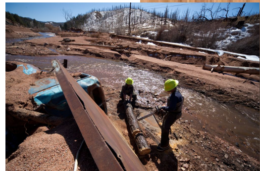
Hayman Fire restoration begins

Treasured Landscapes, Unforgettable Experiences Conservation Campaign. NFF launched this campaign in 2008 to address two critical challenges: millions of forested acres in need of restoration and millions of people unaware of how national forests enrich their lives. Four years later, well over 800,000 acres are now targeted for restoration and community engagement activities through work on fourteen keystone sites, restoring our damaged forests and Americans' connection to these public lands. There are 34 grants open with more than $4 million dollars of work being actively accomplished through this initiative.