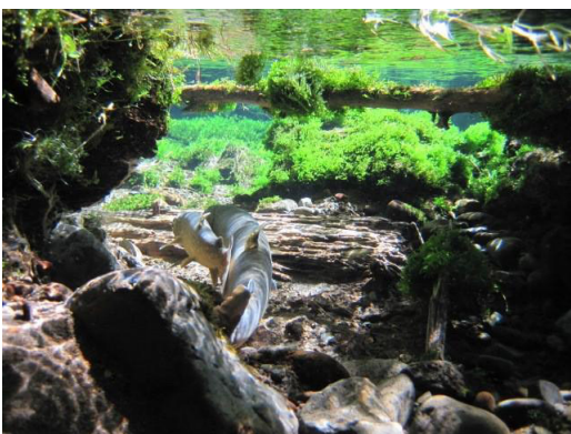
Monitoring bull trout habitat

Oregon Watershed Enhancement Board and Willamette National Forest. Over the last 5 years, the Willamette National Forest received 10 grants totaling approximately $1 million to support collaborative restoration and education efforts on and off the forest, including activities such as in-stream restoration and monitoring for bull trout and spring Chinook. The Oregon Watershed Enhancement Board, which awarded these grants, was championed by Oregon's