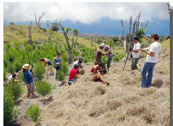
Leeward Haleakala Watershed restoration, Maui, HI

The Forest Service works with a fabric of strategic alliances, including our congressionally chartered nonprofit partners—the National Forest Foundation, National Fish and Wildlife Foundation, and National Environmental Education Foundation. These and other non-government organizations are key to the agency's ability to foster partnerships. Opportunities for partner engagement include not only funding support, but also encouraging significant employee volunteerism across the country in areas where partner and Forest Service interests intersect. Providing wise management of our Nation's water resources; engaging youth in conservation stewardship; promoting healthy, active lifestyles; and serving communities are goals that contribute to a healthy and vibrant America.