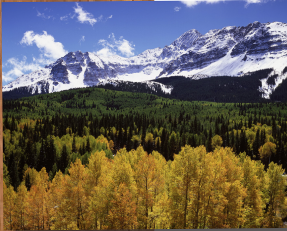
San Juan Mountains, CO

The U.S. Forest Service, the largest agency within the U.S. Department of Agriculture, has a long and distinguished history of public service and land stewardship. Gifford Pinchot, the first Chief of the Forest Service, said that the agency should always work to provide the greatest good for the greatest number of people in the long run.