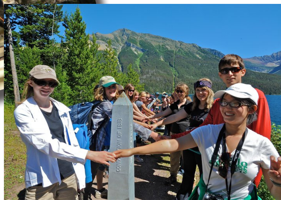
Canada Forest kids