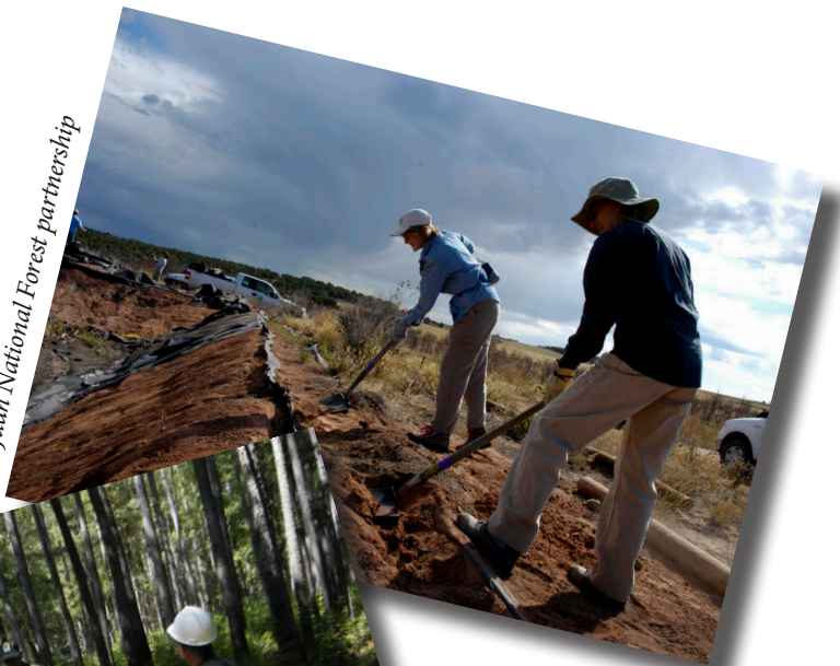
San Juan National Forest partnership