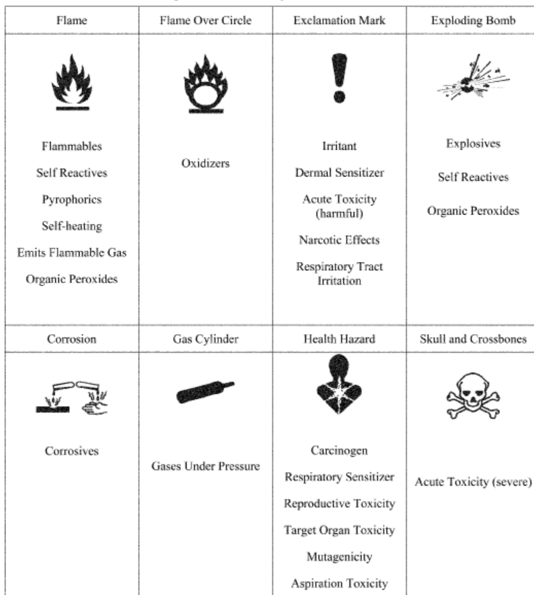
Figure C.1 – Hazard Symbols and Classes

C.2.3.2 One of eight standard hazard symbols shall be used in each pictogram. The eight hazard symbols are depicted in Figure C.1. A pictogram using the exclamation mark symbol is presented in Figure C.2, for the purpose of illustration.