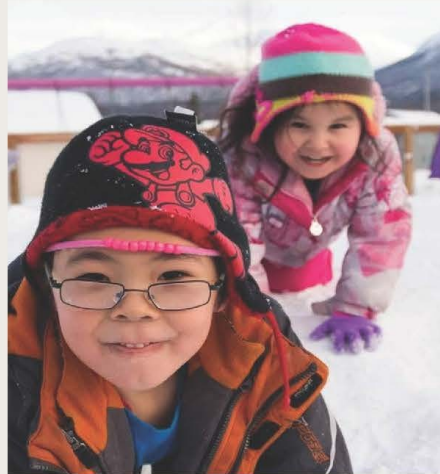
Image shared with permission from the National Center on Early Childhood Development, Teaching, and Learning.

All the answers you give are private and not permitted by law. They will never be shared with anyone from Head Start. You do not need to take part in the study. If you decide to take part in the study, you will be asked to complete part of AIAN FACES (even though you may not be in Head Start services). AIAN FACES is sponsored by the Administration for Children and Families, the government agency overseeing Head Start. Mathematica is conducting the study.