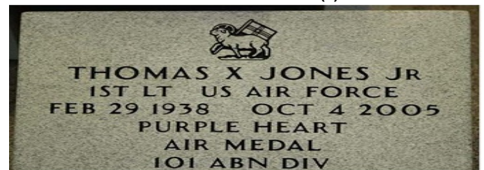
SMALL FLAT GRANITE (L)

This grave marker is 18 inches long, 12 inches wide, and 3 inches thick. Weight is approximately 70 pounds. Variations may occur in stone color.