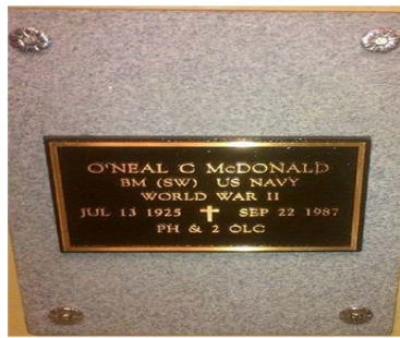
BRONZE NICHE (Z)

This niche marker is 8-1/2 inches long, 5-1/2 inches wide, with 7/16 inch rise. Weight is approximately 3 pounds; mounting bolts and washers are furnished with the marker. Used for columbarium or mausoleum interment. Also provided to supplement a privately-purchased, permanent and durable headstone or marker for eligible Veterans who died on or after November 1, 1990 and are buried in a private cemetery.