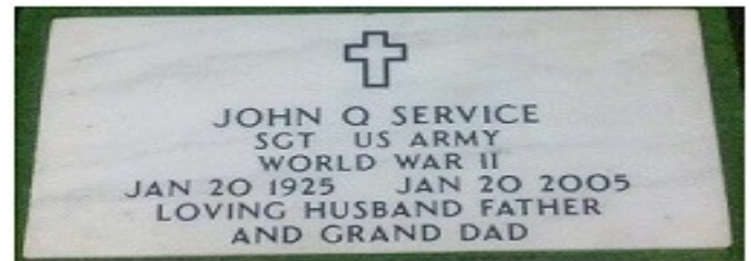
LIGHT GRAY GRANITE (G) OR WHITE MARBLE (F)

This grave marker is 24 inches long, 12 inches wide, and 4 inches thick. Weight is approximately 130 pounds. Variations may occur in stone color; the marble may contain light to moderate veining.