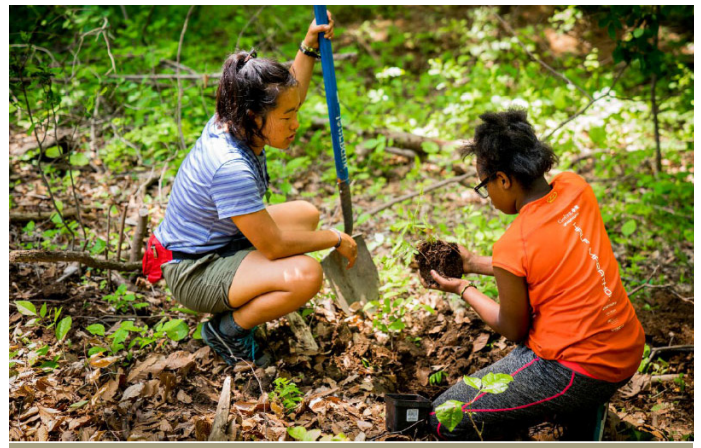
Volunteers work to restore forest habitat in Gwynn Falls Leakin Park in Baltimore by removing invasive species and planting native trees and shrubs. Greater Baltimore Wilderness Coalition

Non-Native, Invasive Plant Species. As the U.S. population has grown, native plant and animal communities have been adversely impacted by the purposeful and accidental introduction of non-native plant species. Non-native species are those plant species that were not present at the time of European settlement. Because of very aggressive growth habits many non-native species become invasive and out-compete native plants. Not only are native plants at risk, but also the native wildlife species that depend on them, especially insect populations that birds depend on for foraging. This can be manifested as direct loss of plant food or loss of native habitat as non-native species out-compete native plants. Native plants support greater and more diverse insect populations so restoring native habitat is vital for restoring a healthy ecological community for birds.