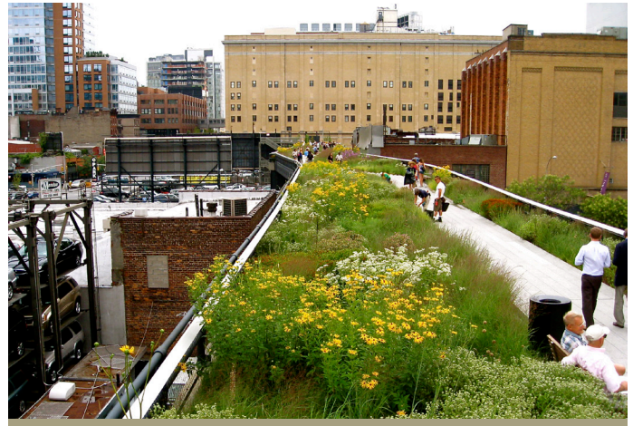
Creating green spaces--such as green roofs--in urban environments is good for birds and people. Stacy Jean

By using the steps of social marketing it is possible to move individuals, communities, cities and states—even the entire country—to a new system of norms where consideration of urban bird safety and sustainability is ingrained in all levels of behavior, and policies and regulations promote and reinforce these new standards. Visit the sites below to learn more about the human dimensions of conservation and social marketing for environmental sustainability. These strategies can be used to address all the bird hazards described in the following sections.