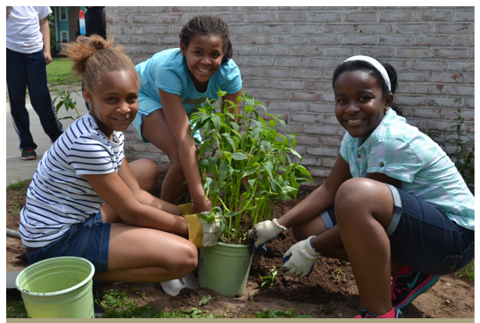
Students planting native shrubs at their schoolyard habitat in New Haven, CT. Audubon CT

Green roofs—roofs covered in soil and a variety of native plants—are a great solution to creating bird habitat in cities where ground space is limited. Studies have shown that a variety of birds use