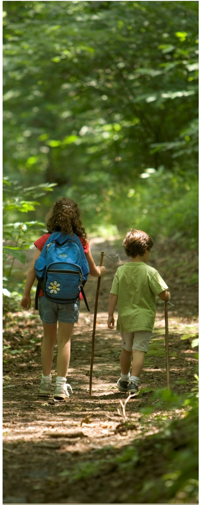
Spending time outdoors walking in the woods can deepen our connection with nature and improve our health and well-being.

Bird habitats also provide places for people to spend time outdoors deepening their connection with nature, which has been shown to improve people's health and quality of life. Birdwatching, for example,