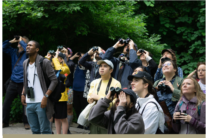
Pride Week Bird Walk sponsored by NYC Audubon. NYC Audubon

Smithsonian Migratory Bird Center education programs: https://nationalzoo.si.edu/migratory-birds/school-programs