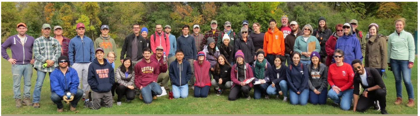
The Bird The Preserves initiative was launched in 2016 to promote Chicago's Forest Preserves as a world-class destination for birding—and to expose new audiences to this popular activity. Forest Preserves of Cook County

413-253-8424 (fax) roxanne_bogart@fws.gov , https://www.fws.gov/urban/urbanBirdTreaty.php