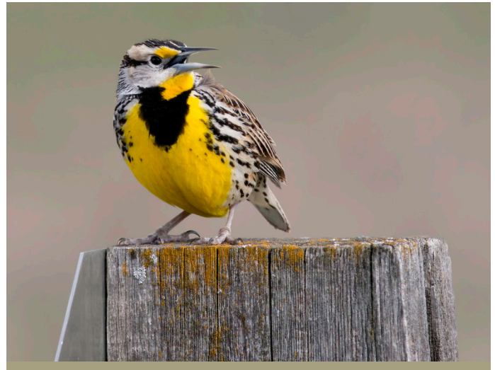
Eastern Meadowlark is a Partners in Flight Common Bird in Steep Decline that is a frequent visitor of backyard bird feeders. Kelly Cogan-Azar

Be sure to consider the benefits of urban areas to Birds of Conservation Concern and Watchlist species that may overwinter or journey through the city during fall and spring migrations. Lists of these species can be found at https://www.fws.gov/birds/management/managed-species/birds-of-conservation-concern.php and http://www.stateofthebirds.org/2016/resources/species-assessments/ . Species that are of priority in your state and Migratory Bird Joint Venture region can be found by visiting https://www.fishwildlife.org/afwa-informs/state-wildlife-action-plans and http://mbjv.org .