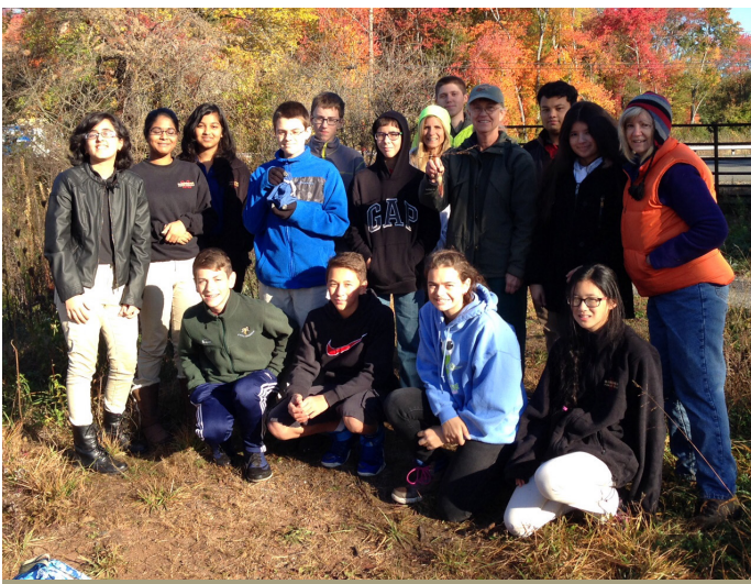
Bird banding event in Hartford, CT.