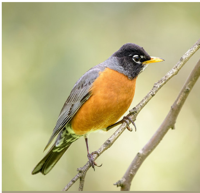
American Robin is a common urban and suburban bird species that forages largely on lawns, making it vulnerable to pesticide poisoning.

Community engagement in restoring bird habitats in parks, schoolyards, backyards, places of worship, roadsides, and right-of-ways can make a big difference for birds. Reducing the threats of building glass and lights in airspace and the hazards of chemicals, plastics, invasive species, and non-native predators is also crucial to improving bird survival in cities. Through the UBT program, partners are working hard to enhance their city's livability for birds that nest in and migrate through their urban areas. This is not only good for birds, but also for the health and well-being of people living in and visiting cities.