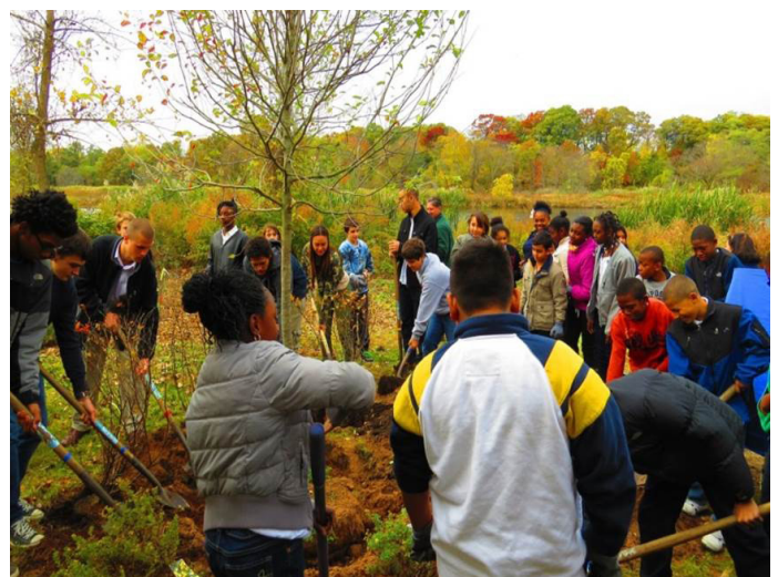
Volunteers working together to plant trees along the West River in Hartford, CT. Park Watershed