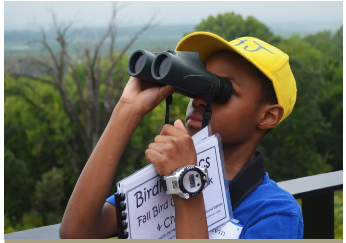
Students learning the basics of birding -- a great way to help people deepen their connection to nature.