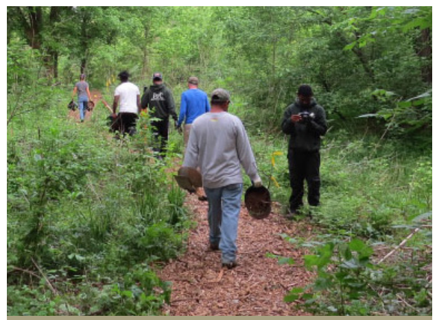
Atlanta Youth Corps crew working on a habitat restoration project at Emma Wetlands.

Many migratory birds arrive to find city habitat destroyed by development, overrun by exotic species, or polluted and depleted by human use. Led by Atlanta Audubon, Atlanta’s Urban Bird Treaty projects engage communities in creating and enhancing bird-friendly habitat by eradicating invasive, exotic plants and installing native plants in urban green spaces to provide quality bird foraging, nesting, and stopover habitat. This work has occurred at places such as Emma Wetlands at Blue Heron Nature Preserve and The Confluence of Peachtree Creek— Atlanta Audubon’s initial bird-friendly habitat restoration projects which now serve as models for future projects. Project sites—which engage the local community in restoration and monitoring and involve multiple partners around Atlanta—have attracted nearly 125 species of birds, indicating the importance of Atlanta’s urban habitats to birds and other wildlife.