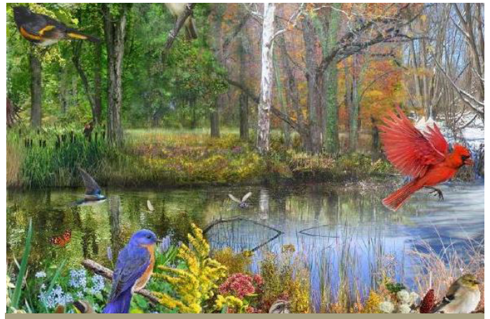
Illustration from the Greater Hartford Plant Palette poster that depicts migratory and resident birds and the native plants and seasonal food sources they need to survive. Park Watershed http://www.parkwatershed.org/wp-content/uploads/2013/05/BackGraphic_5_1_14.pdf

Cornell Lab of Ornithology and The Nature Conservancy's Habitat Network: Articles on how to cultivate habitat for birds and other wildlife.