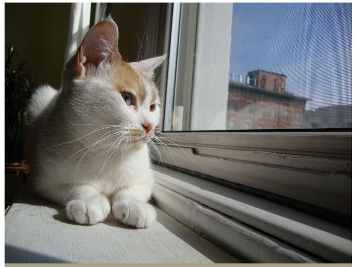
Keeping cats indoors is one of the best ways to help cats and birds. Petsafe

International Dark Skies Initiative: https://www.darksky.org/ and information on certified light fixtures: https://www.darksky.org/our-work/lighting/