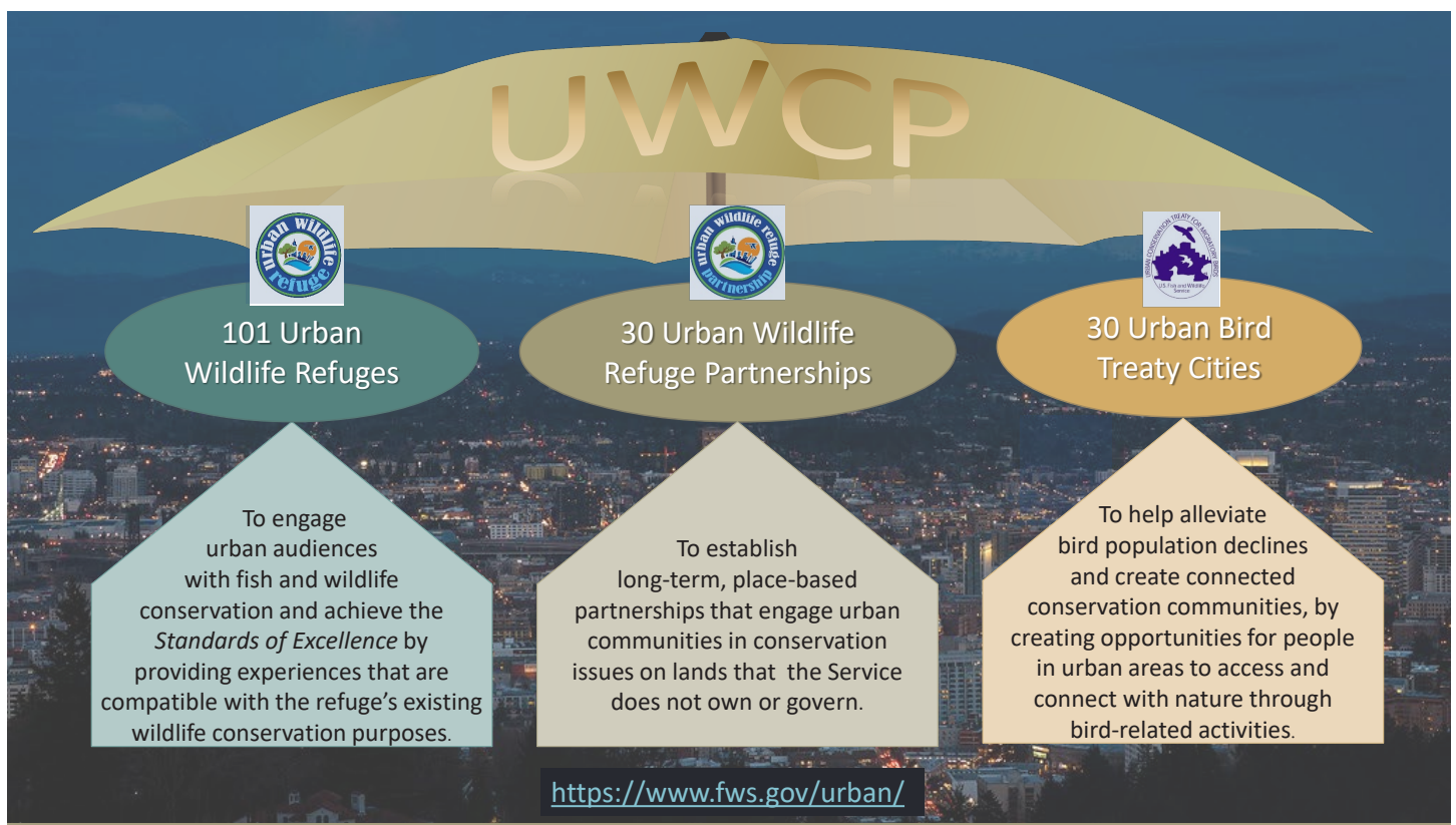
Figure 1. The Service's Urban Wildlife Conservation Program structure. Sandy Spakoff/USFWS

The UBT program is administered through the Service's Migratory Bird Program and is part of the inter-programmatic Urban Wildlife Conservation Program (UWCP), which includes Urban Wildlife Refuges (UWR) and Urban Wildlife Refuge Partnerships (UWRP) located in urban areas all across the U.S. (see Figure 1). These programs likewise work to empower local organizations in urban areas to seek innovative community-based solutions that promote environmental equity and inclusion, and healthy environments for wildlife and people. The UWCP programs overlap geographically and programmatically and many cities host active UBT partnerships, UWRs, and/or UWRPs. For more information on the UWCP, visit https://www.fws.gov/urban/ .