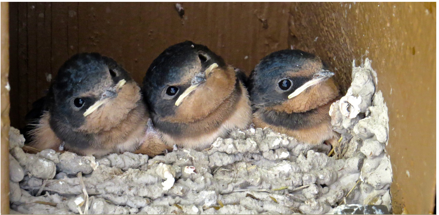
The Barn Swallow uses both urban and farmland areas for breeding and build their cup-shaped mud nests almost exclusively on human-made structures.