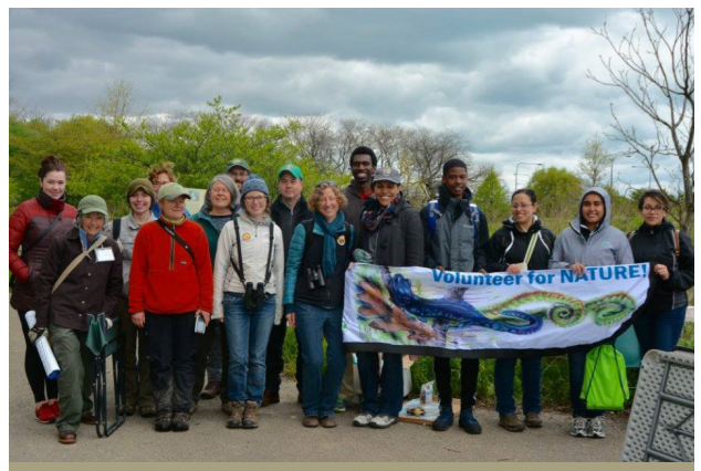
Chicago’s Bird the Preserves Initiative. FPCC

Chicago’s Bird the Preserves is an initiative designed to connect diverse communities to the preserves, expand birding programs and activities, and establish the Forest Preserves of Cook County (FPCC) as a premiere birding destination in the Chicago Wilderness region. The FPCC’s nearly 70,000 acres provide abundant opportunities to see 365 types of resident and migrant birds, both common and unusual, that depend on forest preserve habitat. Committed to ensuring that all people feel welcome at the preserves, the FPCC works with Chicago Audubon Society and other partners to reach out to diverse communities to introduce them to all that the forest preserves have to offer. Birding can serve as a gateway activity to a greater connection to the natural world by providing a positive and fun experience in nature.