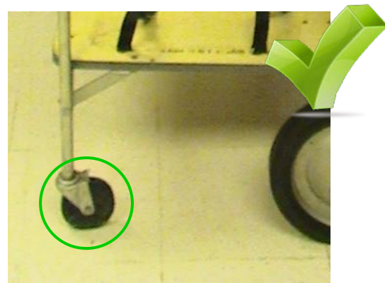
Figure 2 - Rollers pointed inward