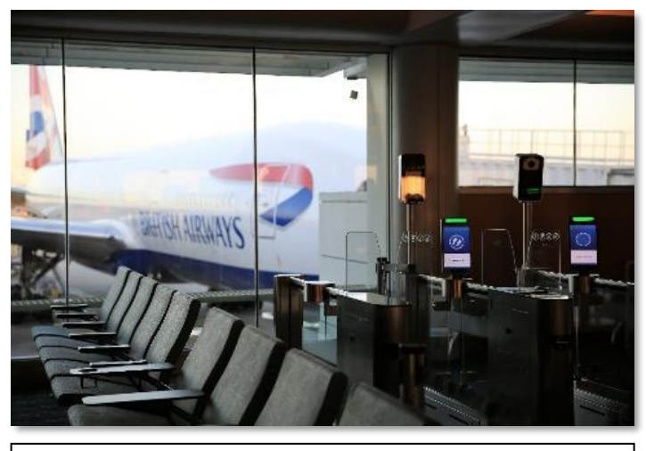
Figure 2. British Airways deployment of "eGates" facial recognition technology in partnership with CBP at Orlando International Airport.

operators and camera technology meeting CBP's technical specifications to capture facial images of travelers and use the TVS matching service for identity verification. Each camera is connected to the TVS via a secure, encrypted connection. While the photo capture process may vary slightly according to the unique requirements of each participating airline and airport the infrastructure authority, IT supporting the backend process is the same. Please see Appendix B for a full list of up-to-date CBP commercial partnerships and deployments.