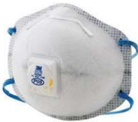
N95 Respirator used to reduce workers' dust exposure.

Dangerous bacteria and molds exist in livestock dust. Breathing dust may lead to respiratory conditions like allergies or asthma in bison handlers. It is important to reduce the amount of dust that is inhaled during bison roundups. To reduce the amount of dust being inhaled, masks such as two strap NIOSH approved masks (N95 respirators) can be worn. Instructions for use on the packaging must be followed to ensure complete protection. Workers can decrease dust at roundups by spraying dusty areas with water.