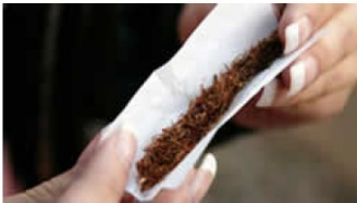
Hand Rolled Cigarette