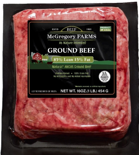
Version 3 = border