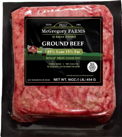
Version 1 = control