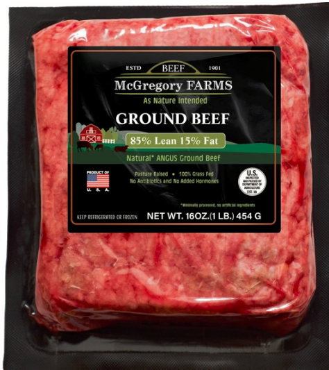
Version 2 = icon