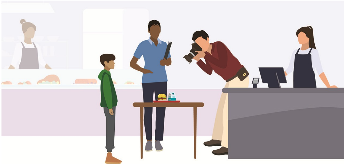
Exhibit 1. Illustration of on-site data collection using both methods simultaneously