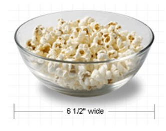
3 cups popcorn