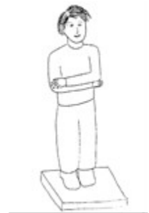
Figure 1: Stance for modified Romberg test

Participants will stand with their feet together and their arms crossed at their waist, holding their elbows (see Figure 1). The technician will attach a safety belt around the participant's waist. Participants will hold that stance for as long as they can under five separate conditions to a maximum of 15 seconds for condition 1 - 2 and 30 seconds for conditions 3 - 5):