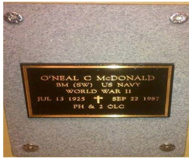
BRONZE NICHE (Z)

This niche marker is 8-1/2 inches long, 5-1/2 inches wide, with 7/16 inch rise. Weight is approximately 3 pounds; mounting bolts and washers are furnished with the marker. Used for columbarium or mausoleum interment. Also provided to supplement a privately-purchased, permanent and durable headstone or marker for eligible Veterans who died on or after November 1, 1990 and are buried in a private cemetery.