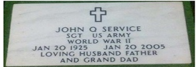
LIGHT GRAY GRANITE (G) OR WHITE MARBLE (F)

This grave marker is 24 inches long, 12 inches wide, and 4 inches thick. Weight is approximately 130 pounds. Variations may occur in stone color; the marble may contain light to moderate veining.