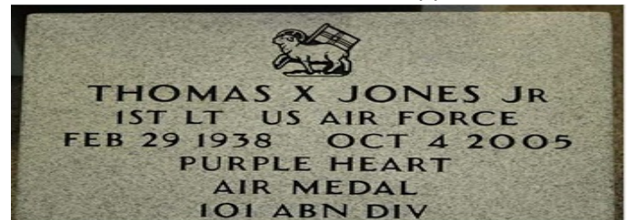
SMALL FLAT GRANITE (L)

This grave marker is 18 inches long, 12 inches wide, and 3 inches thick. Weight is approximately 70 pounds. Variations may occur in stone color.