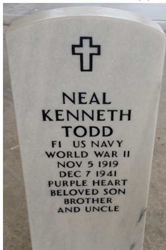
UPRIGHT HEADSTONE WHITE MARBLE (U) OR LIGHT GRAY GRANITE (V)

This headstone is 42 inches long, 13 inches wide and 4 inches thick. Weight is approximately 230 pounds. Variations may occur in stone color, and the marble may contain light to moderate veining. Additional inscription is limited to 15 characters (including spaces) up to four lines maximum.