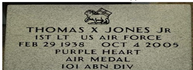
SMALL FLAT GRANITE (L)

This grave marker is 18 inches long, 12 inches wide, and 3 inches thick. Weight is approximately 70 pounds. Variations may occur in stone color. Additional inscription is limited to 27 characters (including spaces) up to two lines maximum.