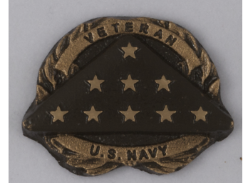
Small Medallion Dimensions: 2" W, 1 1/2" H, 1/3" D

WHO IS ELIGIBLE - Any deceased Veteran discharged under honorable conditions, who served in the Armed Forces on or after April 6, 1917, and is buried in a private cemetery in a grave marked with a privately purchased headstone or marker. Any Servicemember of the Armed Forces of the United States who served on or after April 6, 1917, and died on active duty and is buried in a private cemetery in a grave marked with a privately purchased headstone or marker. Service after September 7, 1980, must be for a minimum of 24 months continuous active duty or be completed under special circumstances, e.g., death on active duty. Persons who have only limited active duty service for training while in the National Guard or Reserves are not eligible unless there are special circumstances, e.g., death while on active duty, or as a result of training. Reservists and National Guard members who, at time of death, were entitled to retired pay, or would have been entitled, but for being under the age of 60, are eligible; please submit a copy of the Reserve Retirement Eligibility Benefits Letter with the claim. Reservists called to active duty other than training and National Guard members who are Federalized and who serve for the period called are eligible.