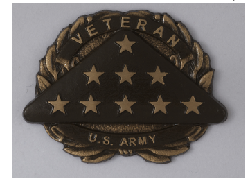
Medium Medallion Dimensions: 3 3/4" W, 2 7/8" H, 1/4" D