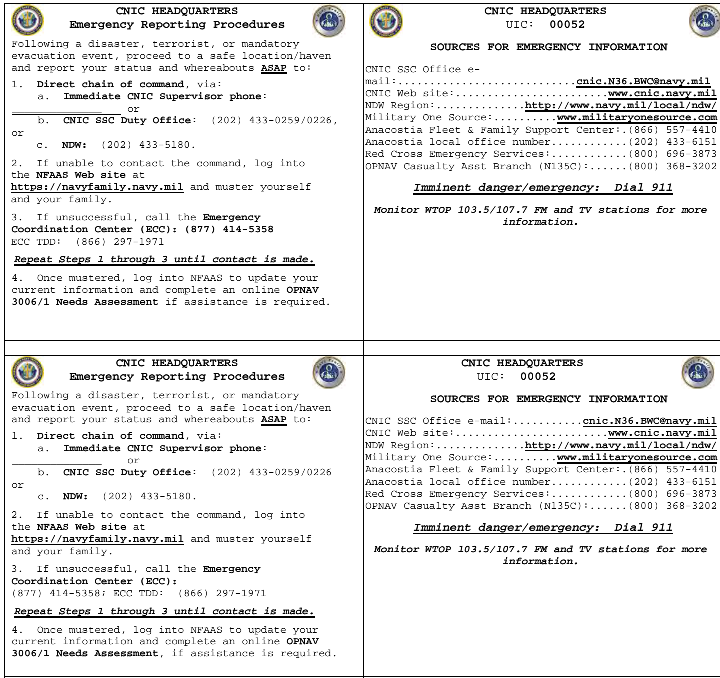
WALLET SIZE CARD (EXAMPLE ONLY)