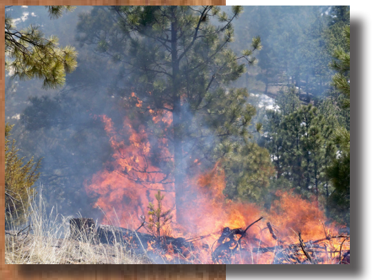
Active fuel treatment in the municipal watershed

The projects these partner investments help enable are stretched across every corner of the country, and their goals are diverse and worthwhile: reducing mega-fire risk, improving oak and pine regeneration, restoring water channels and jobs, and more.