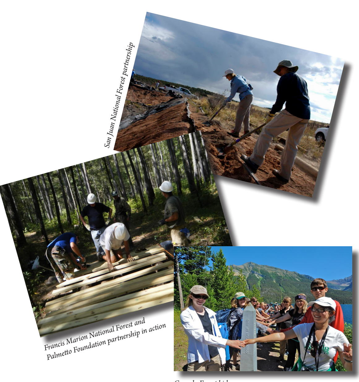
Canada Forest kids

A Look at Partnerships Within the USDA Forest Service