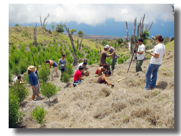
Leeward Haleakala Watershed restoration, Maui, HI

agency's ability to foster partnerships. Opportunities for partner engagement include not only funding support, but also encouraging significant employee volunteerism across the country in areas where partner and Forest Service interests intersect. Providing wise management of our Nation's water resources; engaging youth in conservation stewardship; promoting healthy, active lifestyles; and serving communities are goals that contribute to a healthy and vibrant America.