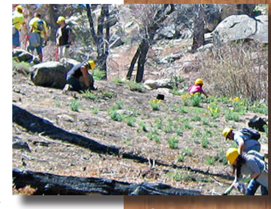
Station Fire restoration

Sequestering Carbon by Reforesting National Forests. This partnership<sup>4</sup> enables organizations to reduce their greenhouse gas emissions through the voluntary marketplace and reforestation efforts. The result will be restored wildlife habitat, improved water quality, and climate change mitigation. Since 2008, NFF has facilitated eight carbon sequestration projects that cover more than 5,000 acres of national forest lands, involve planting 1.3 million seedlings, and are anticipated to offset 700,000 metric tons of carbon. Nearly $5 million in partner contributions have already been raised to fund this initiative by corporate partners, including Disney, the Southcoast Air Quality Management District in California, El Paso Corporation, and Chevrolet.