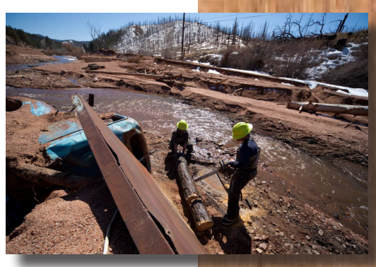
Hayman Fire restoration begins

Treasured Landscapes, Unforgettable Experiences Conservation Campaign. NFF launched this campaign in 2008 to address two critical challenges: millions of forested acres in need of restoration and millions of people unaware of how national forests enrich their lives. Four years later, well over 800,000 acres are now targeted for restoration and community engagement activities through work on fourteen keystone sites, restoring our damaged forests and Americans' connection to these public lands. There are 34 grants open with more than $4 million dollars of work being actively accomplished through this initiative.