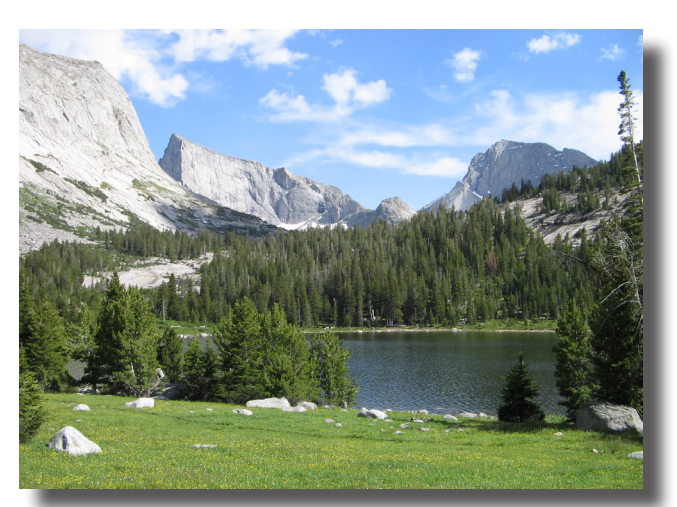
Bridger Wilderness in Wyoming