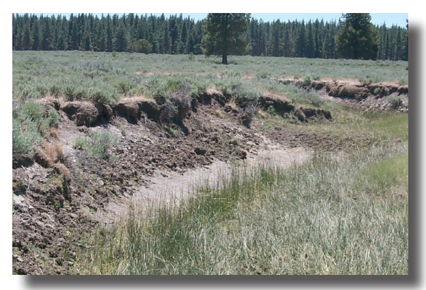
Folchi Creek Watershed in CA

California Ecological Restoration with Power and Water Utilities Initiative. Half of all surface water in California originates on national forest watersheds, with downstream consumers realizing an estimated value of nearly $10 billion every year. But there are significant threats to these valuable watersheds. This partnership brings beneficiaries of the watersheds together to overcome resource challenges, forming relationships with major utilities and encouraging restoration work in key ecosystems.