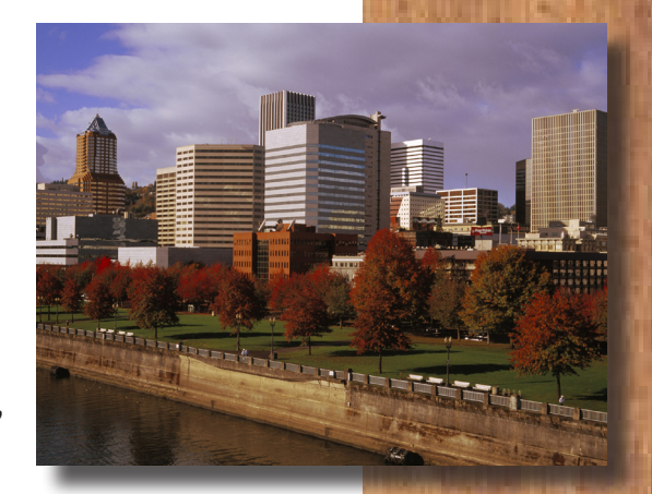
Portland, OR, waterfront

Urban Waters Federal Partnership. Many of our Nation's urban rivers, streams, lakes, forests, and wetlands are polluted, degraded or inaccessible. Research demonstrates that a clean, safe, accessible, urban environment—including urban forests, gardens, parks, lakes, aquifers, and rivers—is directly linked to improved public health, stronger local economies, and lower crime rates. Through the Urban Waters Federal Partnership, the Forest Service and 11 other Federal agencies are revitalizing urban waters, supporting local partnerships, restoring forest resources, fostering community engagement in urban watersheds, and transforming overlooked assets into drivers of urban revival at seven pilot locations across the country. Nearly $1 million has been committed to accomplishing these goals.