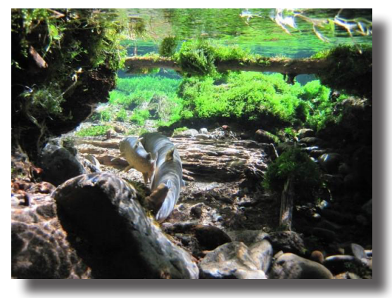
Monitoring bull trout habitat

Oregon Watershed Enhancement Board and Willamette National Forest. Over the last 5 years, the Willamette National Forest received 10 grants totaling approximately $1 million to support collaborative restoration and education efforts on and off the forest, including activities such as in-stream restoration and monitoring for bull trout and spring Chinook. The Oregon Watershed Enhancement Board, which awarded these grants, was championed by Oregon's