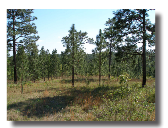
Longleaf pine restoration

America's Longleaf Restoration Initiative. The longleaf pine ecosystem once covered approximately 90 million acres in the Southern United States. But by the early 1990s, 97% of this ecosystem had been lost, stressing the nearly 30 threatened and endangered species that live there. Since then, the Forest Service and the National Fish and Wildlife Foundation (NFWF) have worked with numerous partners to successfully restore longleaf pine forests throughout the Southeast. The America's Longleaf Restoration Initiative, which engages Federal