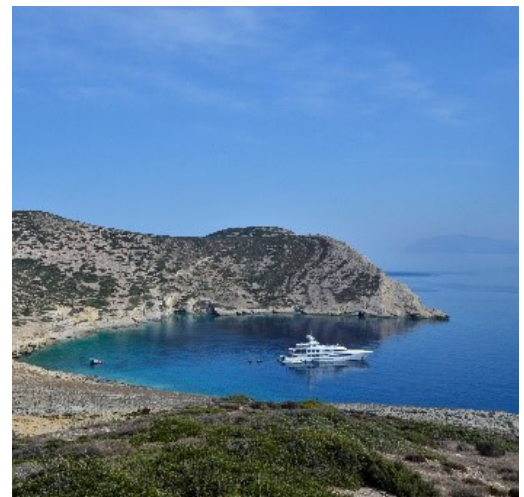
MY Gene Machine