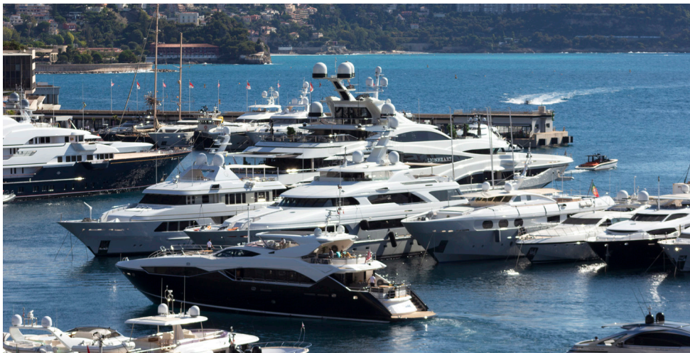
Monaco harbour

Navigational incidents involving superyachts are often quashed by confidentiality agreements which deny lessons to be learnt or shallows to be reported to the hydrographic offices. By contributing data, superyachts can help avoid groundings or environmental damage and make the oceans a safer place for all.