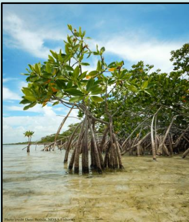
Red mangroves are essential for juvenile smalltooth sawfish survival.

NOAA Fisheries designated critical habitat for smalltooth sawfish on September 2, 2009.