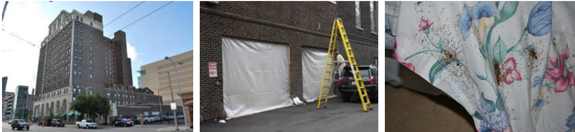
Fig. 8. Biltmore Towers (photos left to right); 18-story building, sealing garage entry, bed bugs infesting a bed cover.