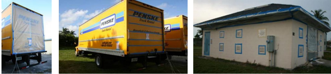
Fig. 7. Tape-and-seal (photos left to right); truck cargo containers (two methods of tape-and-sealing), concrete block garage.