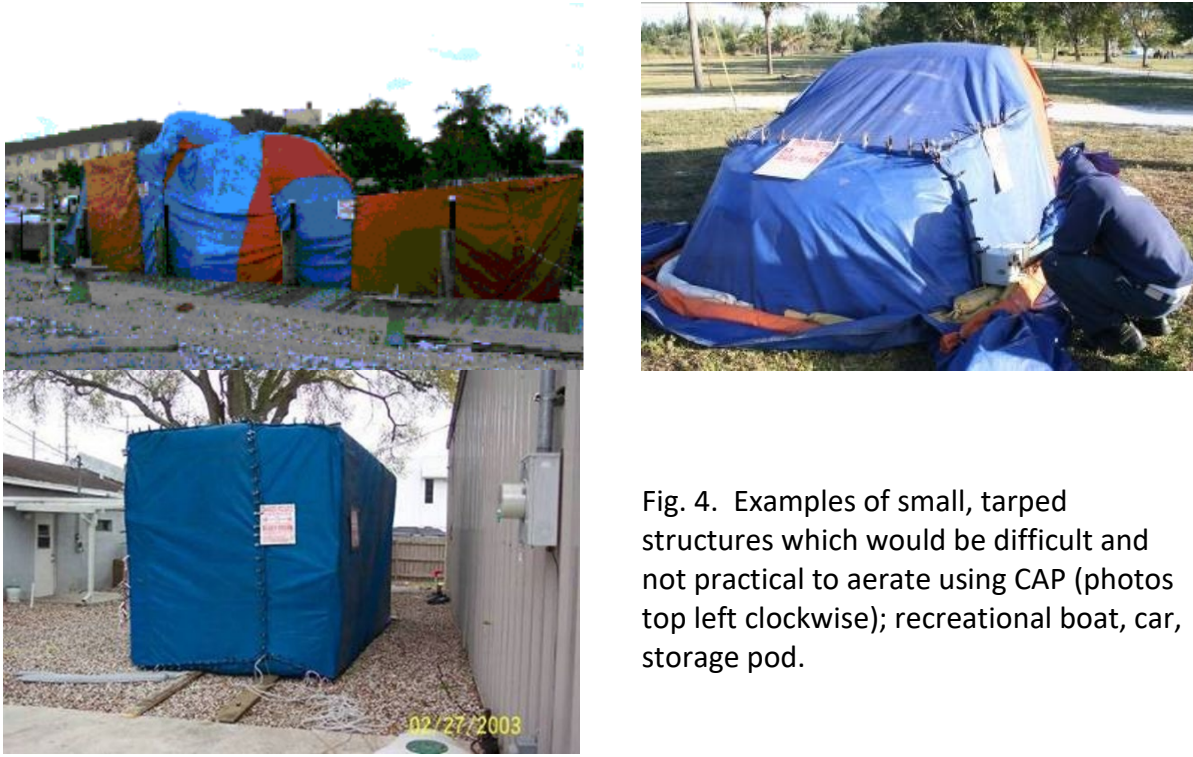
Fig. 4. Examples of small, tarped structures which would be difficult and not practical to aerate using CAP (photos top left clockwise); recreational boat, car, storage pod.