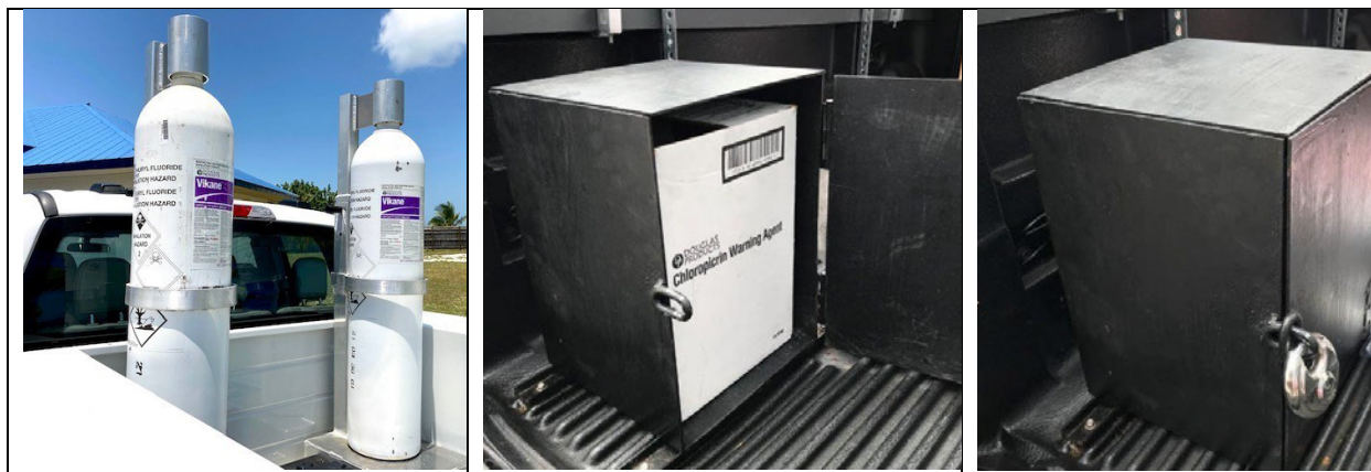
Fig. 2. Proper transportation of cylinders of Vikane ® gas fumigants (left) and chloropicrin container in HAZMAT packaging (center and right).