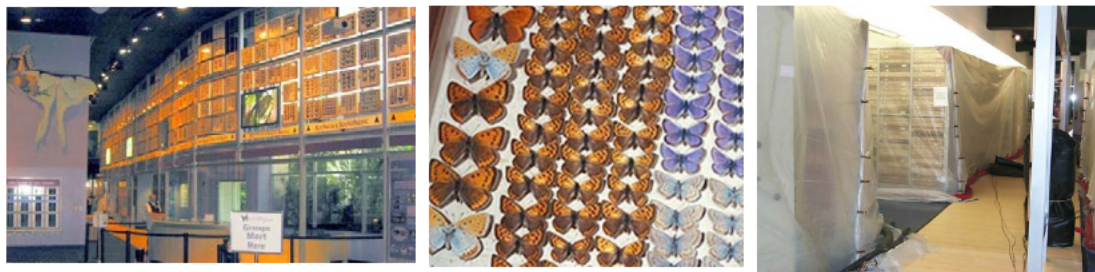
Fig. 6. McGuire Center (photos left to right); museum displays, butterfly collection drawer, tarped stack fumigation of lepidopteran collection.