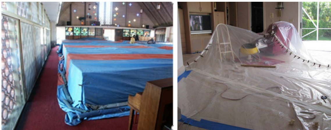
Fig. 5. Tarped pews in church fumigated for control of drywood termites (left, photo by Rudi Scheffrahn), tarped hardwood flooring fumigated for drywood termite control (right).