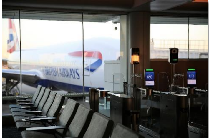
Figure 2. British Airways deployment of “eGates” facial recognition technology in partnership with CBP at Orlando International Airport.

Carrier owned and operated cameras: A number of airlines and airport authorities, some of which are already incorporating the use of traveler photographs into their own business processes, may opt to leverage their own technology in partnership with CBP to facilitate identity verification. In compliance with CBP’s business requirements, these stakeholders deploy their own camera operators and camera technology meeting CBP’s technical specifications to capture facial images of travelers and use the TVS matching service for identity verification. Each camera is connected to the TVS via a secure, encrypted connection. While the photo capture process may vary slightly according to the unique requirements of each participating airline and airport authority, the IT infrastructure supporting the backend process is the same. Please see Appendix B for a full list of up-to-date CBP commercial partnerships and deployments.