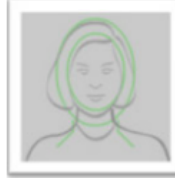
Photo Cropping Tool

To assist in preparing your image, you may click on the icon to the right to use a Department of State photo cropping tool. You may use this tool to resize, rotate, and/or crop a photo on your computer to meet the Department of State's head-size and digital image submission requirements .