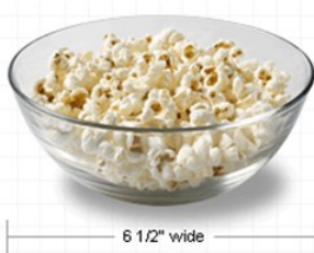
3 cups popcorn