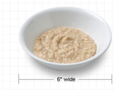
1/2 cup oatmeal