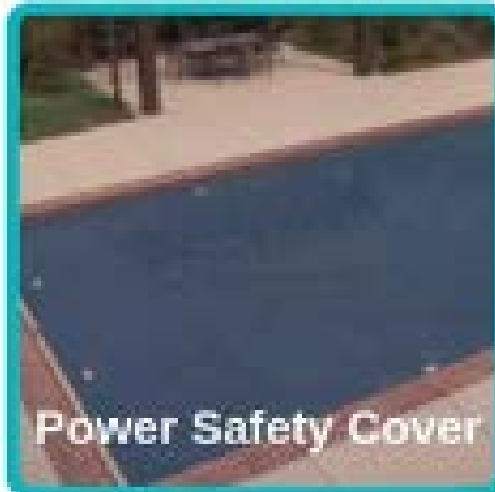
Power Safety Cover