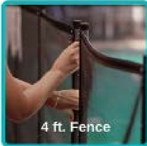
4 ft. Fence