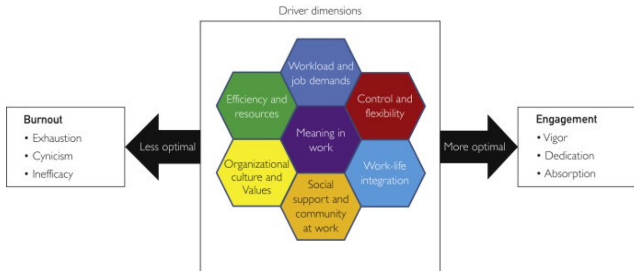
Figure 1. “Key drivers of burnout and engagement in physicians.” 1

contributed towards the third and fourth drafts. The current draft (version 5.0) was further informed by cognitive interviews conducted with a diverse pool of 60 health center staff who had completed the survey. A final draft of the survey will be prepared after pilot testing of the current version with approximately 400 health center employees from across all HRSA-funded health centers.