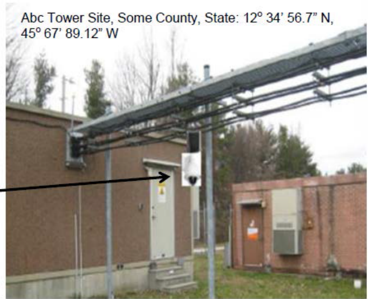
Figure 3. Ground-level photograph with graphic showing proposed equipment installation.

Ground-level photograph with excavation area close-up. The example in Figure 4 shows the proposed location for the concrete pad for a generator and the ground disturbance to connect the generator to the building's electrical service. This information can be illustrated with either an aerial or ground-level photograph, or both. This example has the name and physical address of the project site.