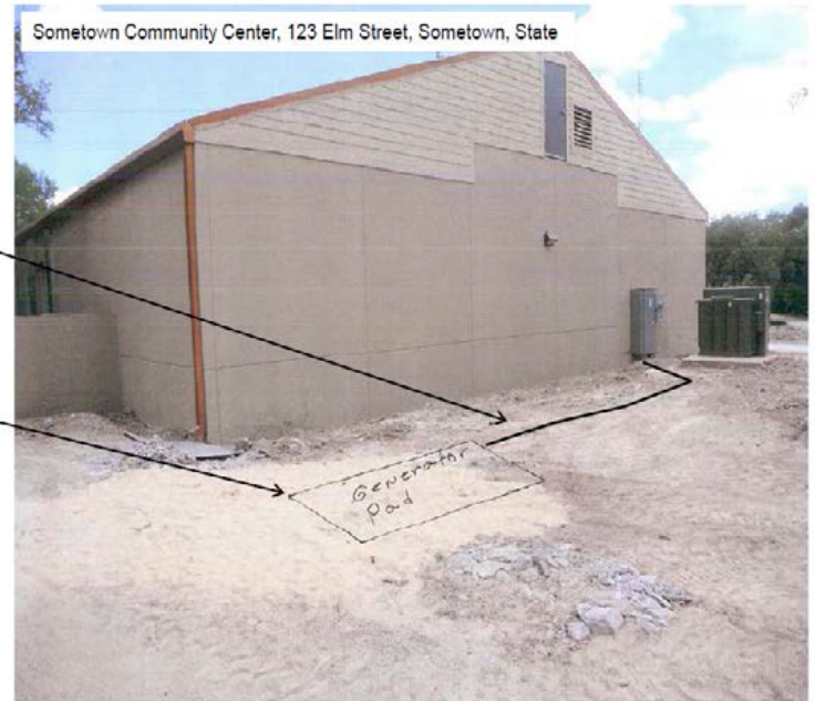
Figure 4. Ground-level photograph showing proposed ground disturbance area.