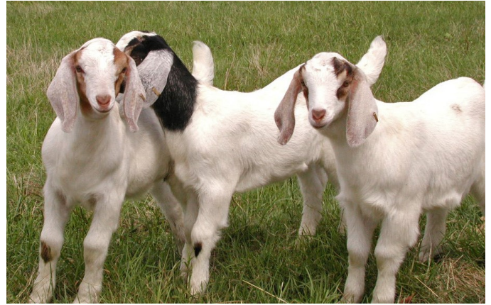
There is less risk on pasture.

Once coccidiosis has been diagnosed, treatment should be provided as early as possible. All animals sharing space should be treated. There is no vaccine for coccidia. Dewormers are not effective against coccidia. In addition, the drugs used to prevent coccidiosis are different from the ones used to treat it. Currently, there are no drugs FDA-approved to treat coccidiosis in sheep and goats. Extra label drug use is required.