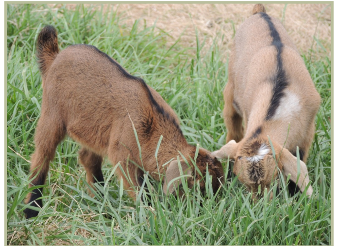
Good grazing practices can help to control worms.

Studies in both sheep and goats have demonstrated that this ability to regulate worms is under genetic control and that it is a moderately heritable characteristic (20-40%). This means that resistant dams and sires will most likely produce resistant kids/lambs. The sire/male contributes 50% of the flock genetics. Therefore, selecting resistant sires may be the most cost-effective and