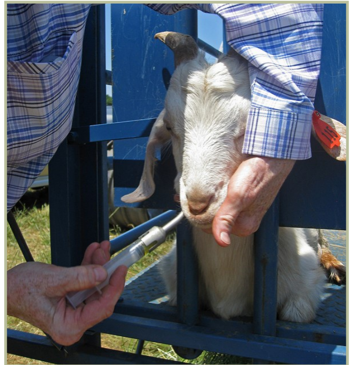
All dewormers should be given orally.

Drug resistance is not only an issue in the US. In other parts of the world such as New Zealand, Australia and South Africa, drug resistance has also become a major threat to the sustainability of their sheep and goat industry. Even with the development and availability of new drugs (monepantel; Zolvix® and dequantel/abamectin, Startect®) effective at killing worms re-