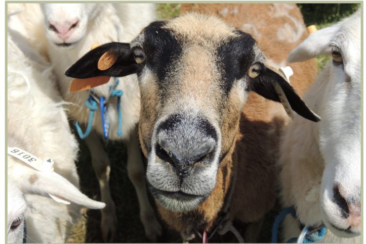
“What do you mean the drugs don’t work?”

Internal parasite infections can impact the productivity of grazing animals significantly. Years of overuse and misuse of available dewormers has led to the development of drug resistance in worm populations on many farms. Drug resistance occurs when a drug loses its ability to effectively kill worms, and the worms continue to survive in the presence of therapeutic levels of the drug (standard prescribed dose). Drug resistance is inevitable and cannot be prevented. However, its development can be slowed down.