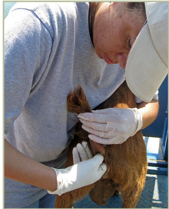
Collecting a fecal sample

What about FEC? Can it be used to determine the need for individual deworming? The simple answer is (most often) no. Quantitative egg counts are important in any internal parasite control program and can aid producers in monitoring the rate of pasture contamination. FEC can also be used to determine drug resistance as described above and also in selecting or culling particular animals. However, most of the time, FEC should not be used as the only indicator of when to deworm individual animals. If FEC are available, they should be used in conjunction with FAMACHA ® and the Five Point Check ® to determine the need for treatment. If an animal has an extremely