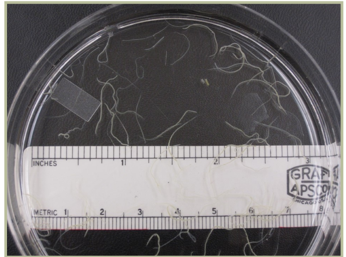
Haemonchus contortus adults removed from the stomach of a sheep. Adult females reach a maximum size of about 1 inch in length.

The length of time required for development of the egg to the L3 stage has an impact on the design of pasture rotation systems. The minimum length of time required for the development of H. contortus larvae is about 3 to 4 days, and numbers of infective larvae can build up quickly in hot summer weather. The activity of dung beetles and earthworms breaks up fecal material and reduces the number of larvae by exposing developing stages to desiccation and ultraviolet light. If eggs are deposited in manure in cool spring weather it may take several months for the L3 larvae to be produced. As a result, larval numbers on cool spring pastures in more northern states may not significantly increase until late spring or early summer.