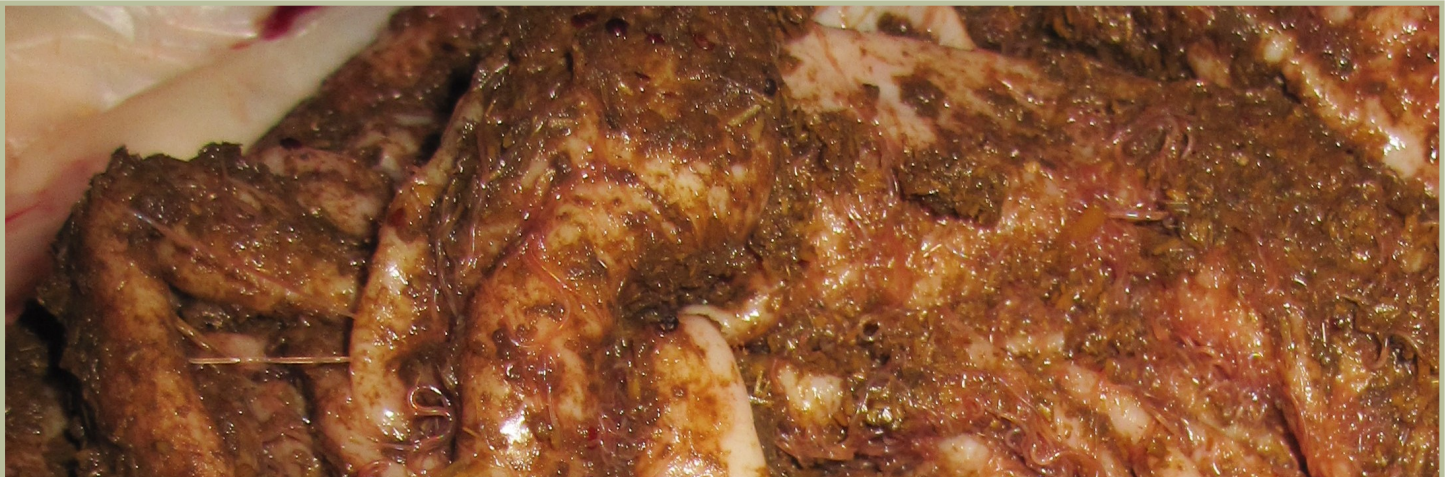
Heavy infection with Haemonchus contortus in the abomasum of a sheep. Some individual worms can be seen, but all the reddish material present is clumps of parasites.