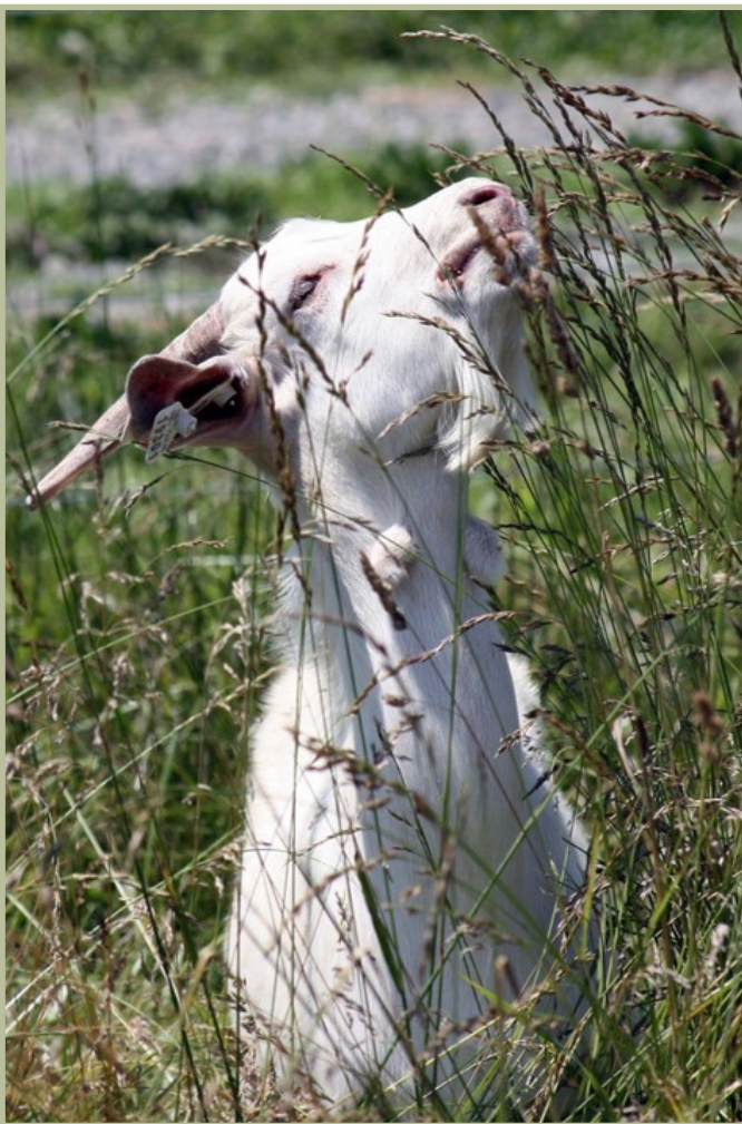
Goat grazing high

In areas where seasonal arrest of parasite larvae occurs, emergence and development of adult worms in late winter and spring are followed by an increase in fecal egg counts. The rise in egg counts is magnified in ewes and does in late pregnancy and early lactation by a relaxation of immunity that increases survival and egg production in existing parasites and also increases susceptibility to further infection. This relaxation in immunity typically begins 2 to 4 weeks prior to and peaks around 2 to 4 weeks post kidding/lambing. The periparturient egg rise can make an important contribution to L3 populations on pastures as young, susceptible animals begin grazing.