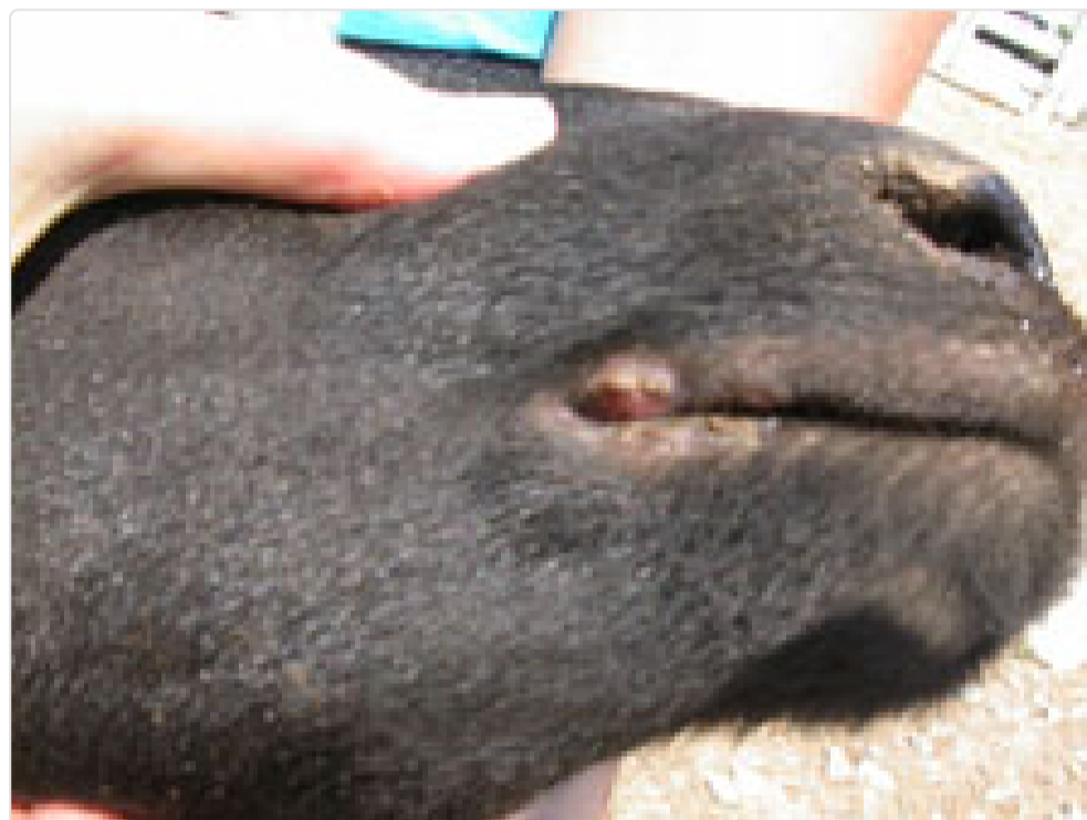
Sore mouth in sheep.

Animals can become infected more than once in their lifetime but repeat infections usually occur after a year's time and are generally less severe.