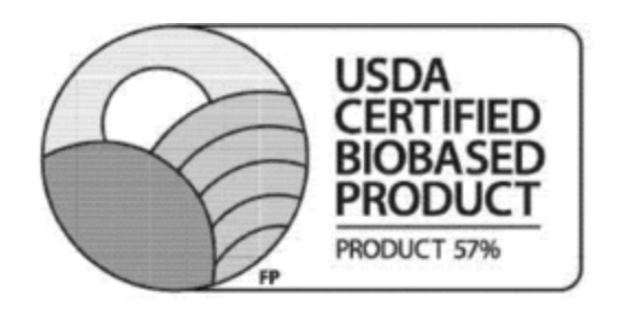
Figure 1. USDA Certified Biobased Product Certification Mark (Note: actual size will vary depending on application)