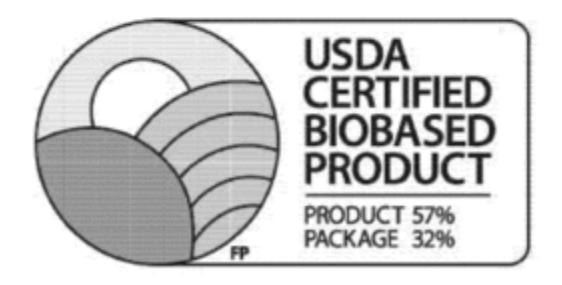
Figure 3. USDA Certified Biobased Product & Package Certification Mark (Note: actual size will vary depending on application