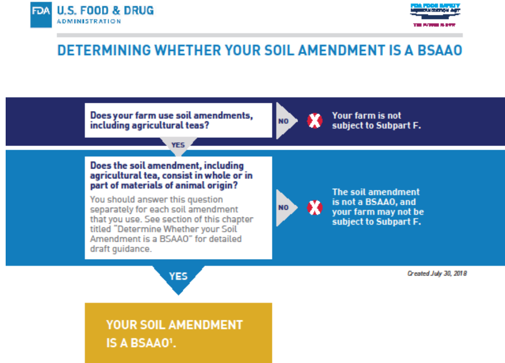
Figure 4a. Determining Whether Your Soil Amendment is a BSAAO