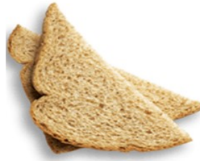
1 slice whole wheat bread