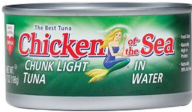
7oz canned tuna