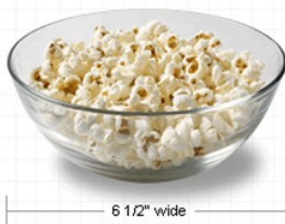
3 cups popcorn