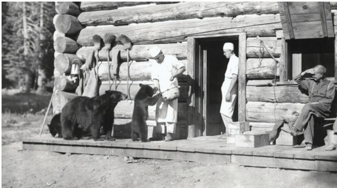
Three bears being fed by a member of the kitchen staff, another kitchen staffer in doorway of log structure at Crater Lake, William G. Steel sitting looking on.