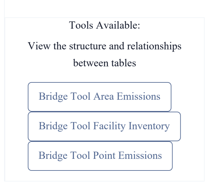
"Easy Way" for XML Emissions Generation

change the coordinates of a facility, only information from the Facility table needs to be provided. It is important to remember the CERS has a hierarchical structure. Consequently, the Bridge Tool needs information to be able to create these structures through relationships between tables.