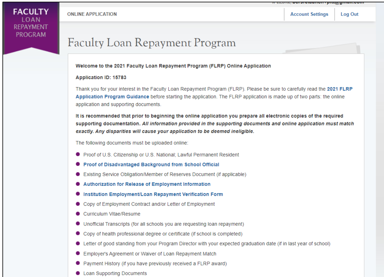
Figure 3: FLRP Application Home Page

Upon logging into the application, the applicant will first see the Home Page. The Home Page will display content as it relates to the application status. If the applicant is in “Not Started” status, the page will display an outline of the FLRP application and a button that allows the applicant to begin the application. Once the application has started, the status will be “In Progress” and the Home Page will display a table with the application progress.